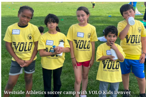
Westside Athletics soccer camp with VOLO Kids Denver

Westside Athletics keeps kids moving with weekly programming focused on wellness and team spirit. Our Running Club, in partnership with Golden Mountain Runners, helps youth set and reach goals together, culminating in 5K races and group runs. Through our soccer program with Volo, kids developed coordination, confidence, and community on and off the field.