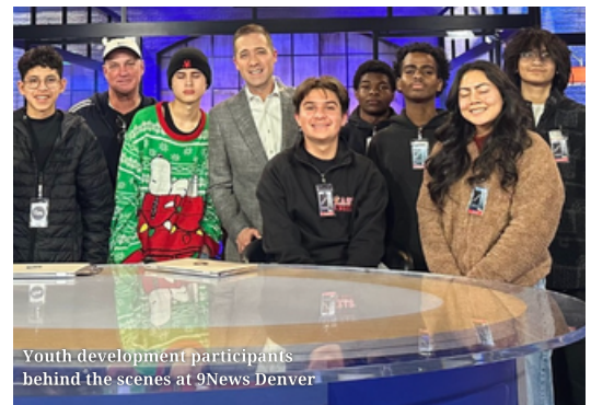
Youth development participants behind the scenes at 9News Denver

We hosted monthly Youth Professional Development Dinners, bringing in guest speakers to cover topics like resume building, financial literacy through programs like Mini Money, and more. Youth also get to explore exciting opportunities—like going behind the scenes at 9News Denver or recording a podcast with Lake Night Radio. And in 2024, we expanded our support by launching monthly mental health sessions for youth employees, providing space for reflection, healing, and wellness.