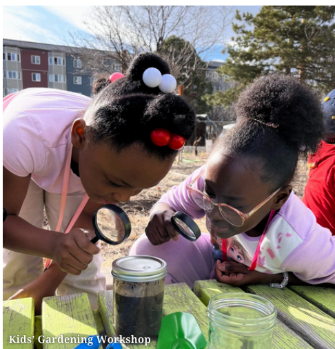
Kids' Gardening Workshop