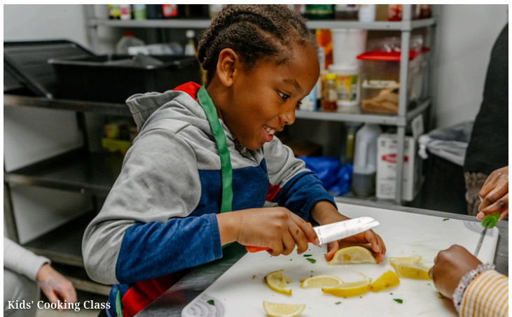
Kids' Cooking Class