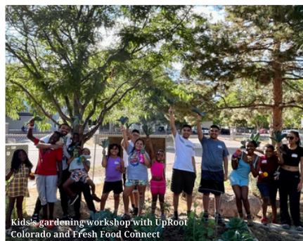
Kids' gardening workshop with UpRoot Colorado and Fresh Food Connect