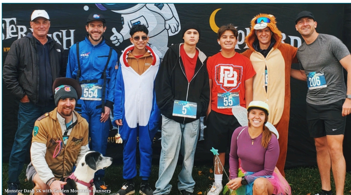
Monster Dash 5K with Golden Mountain Runners

This partnership exemplifies what's possible when people invest in their community with consistency and care. Thanks to Golden Mountain Runners, our youth are not only building endurance—they're building confidence, pride, and connection with every stride.