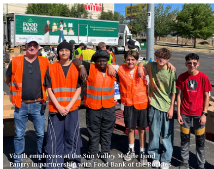
Youth employees at the Sun Valley Mobile Food Pantry in partnership with Food Bank of the Rockies