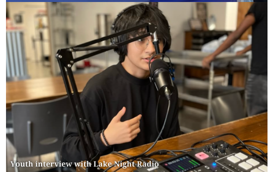
Youth interview with Lake Night Radio