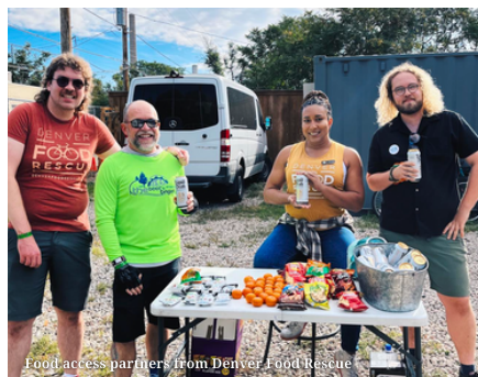
Food access partners from Denver Food Rescue

WHEN YOUNG PEOPLE LEAD AND THE COMMUNITY IS CENTERED, FOOD ACCESS BECOMES SOMETHING DEEPER— IT BECOMES BELONGING.